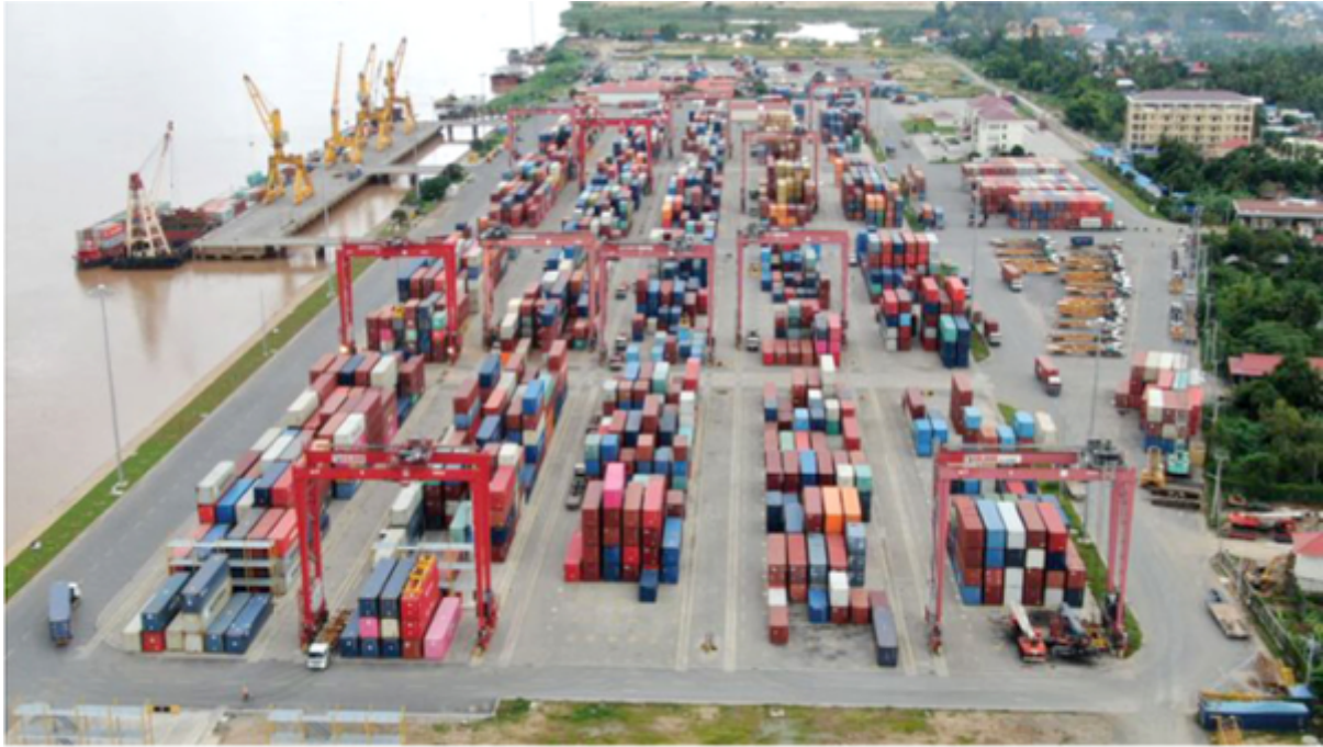
Port in Cambodia

B ilateral trade between the two countries increased by about 31% in January 2022 compared to January 2021. Cambodian exports to South Korea increased sharply year-on-year (+0.993%), imports increased by 49.816% year-on-year.