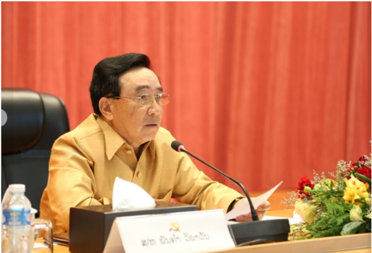
Lao Prime Minister Phankham Viphavanh

In support of Laos' objective to become a land-link country and transit center, Prime Minister Phankham Viphavanh has directed the public works and transportation sectors to construct infrastructure that would improve connectivity.