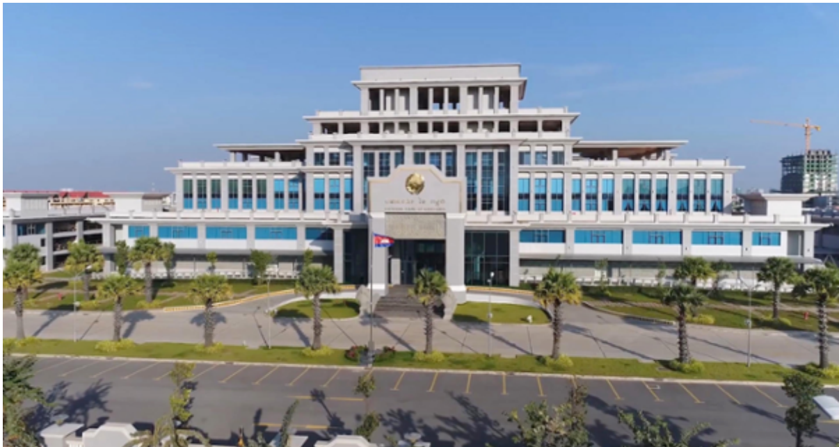
National Bank of Cambodia

On 2 March 2022, the governor of the National Bank of Cambodia, H.E Chea Chanto stated that the two central banks were developing payment systems, especially promoting electronic payments to facilitate bilateral trade and investment, as well as cross-border transfers, which is a part of new plans to further strengthen and expand cooperation between the two countries.