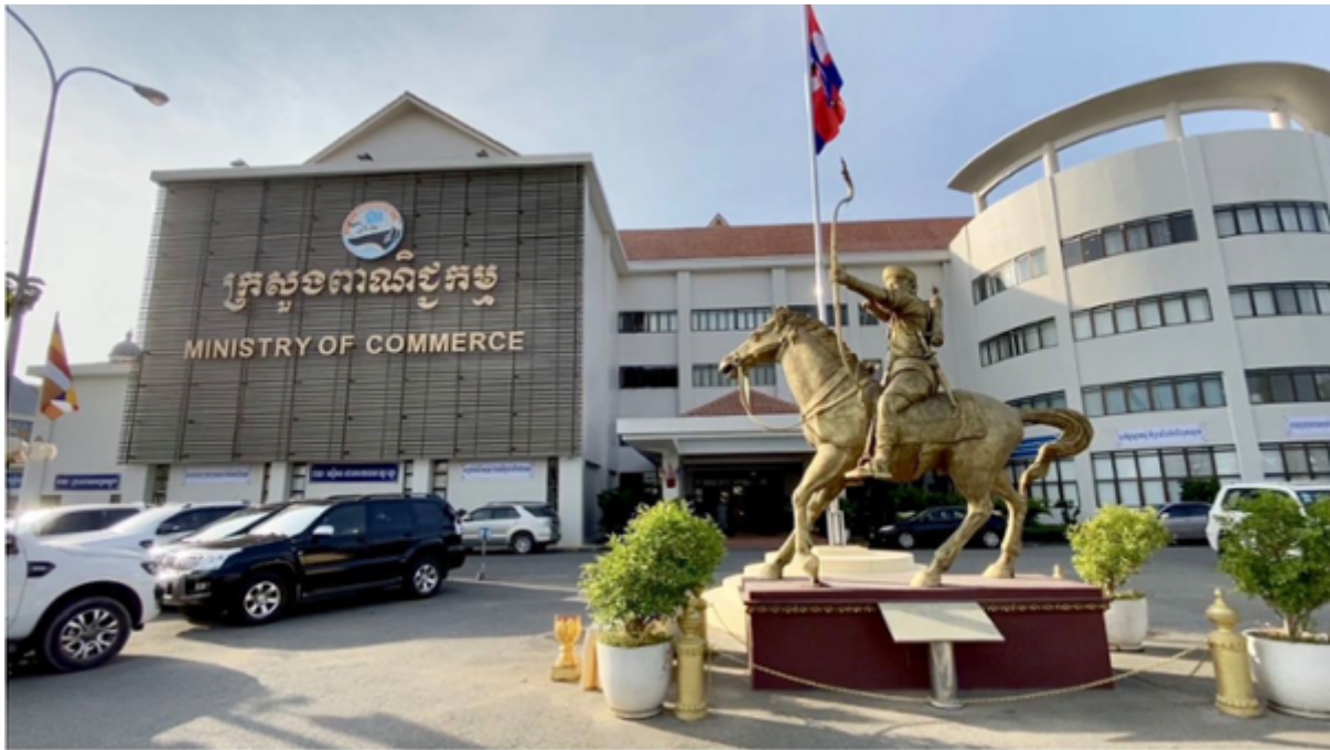
Ministry of Commerce

The Ministry of Commerce notifies individual, enterprises, legal entities, and branches of foreign companies doing business online that the deadline for applying for e-commerce license is extended until July 1, 2022 , in accordance with the notification No. 2908 dated 1 December 2021 on the delays of penalties for late submissions for e-commerce licenses, which expired on March 1, 2022, in order to provide sufficient time for individuals enterprises or e-commerce companies to apply for e-commerce licenses.