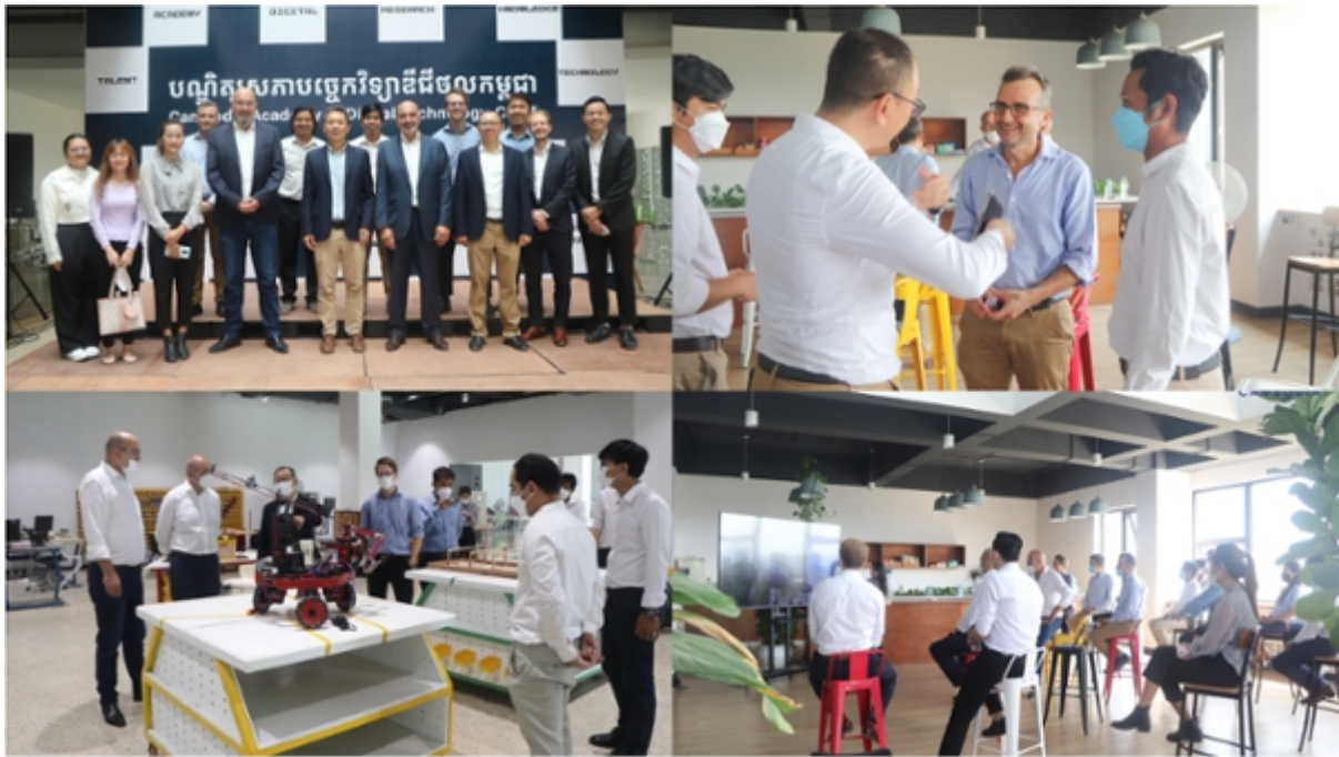
Special Visit to CADT Innovation Center