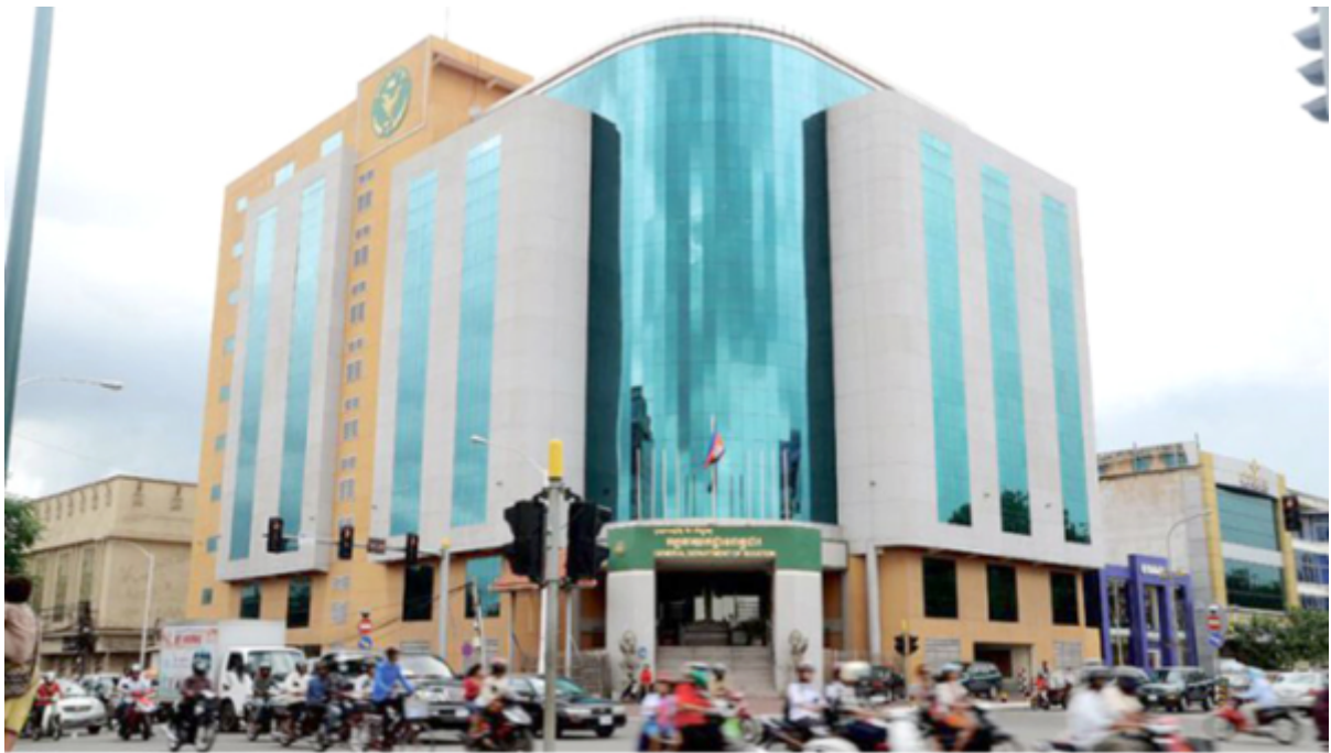
General Department of Taxation Phnom Penh, Cambodia

The General Department of Taxation informs the unit under the GDT and the commercial banks signing a Memorandum of Understanding (MOU) with the Ministry of Economy and Finance that there is a significant amount of invalid receipts after reviewing the Tax Receipt in each unit. In this regard, to strengthen the efficiency, transparency and high savings, the General Department of Taxation makes the following recommendations below: