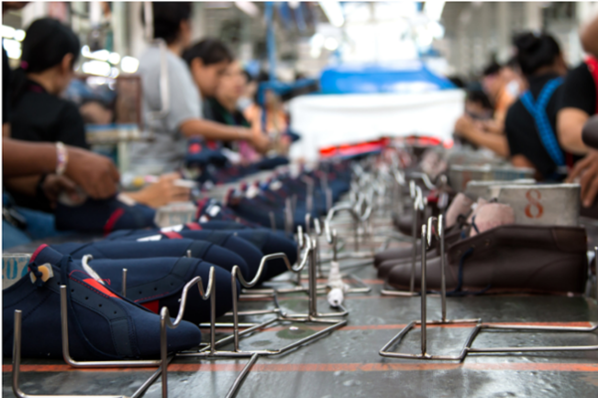
Shoes manufacturing in Cambodia

The Royal Government of Cambodia will shortly release a plan to expand the garment, bag, and footwear sector, which will serve as a road map for the industry's growth and competitiveness.