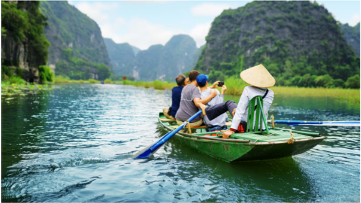
Vietnam's Ngo Dong River

A ccording to proposed regulations from the Ministry of Health, fully vaccinated international visitors can move freely in Vietnam after just one day of isolation following entrance if their Covid-19 tests are negative.