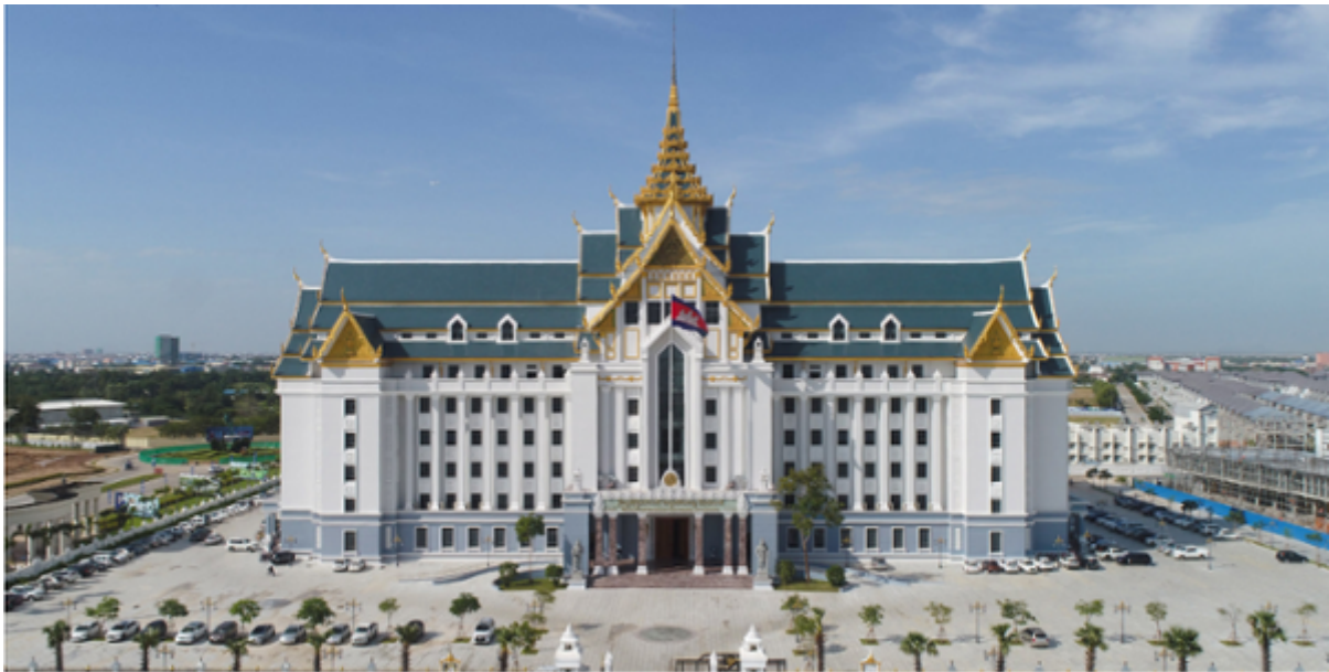
Ministry of Land Management, Urban Planning and Construction

The Ministry of Land Management, Urban Planning and Construction sent a request to provincial governments, asking to boost inspection and prevention of unlicensed demolition or construction of structures. According to the request, it will not allow any construction or dismantling at a site until the architectural and construction plan is approved by the authorities. Without government permission, any work will be considered illegal and ignoring the regulation may impact quality, security, safety or public order rules.